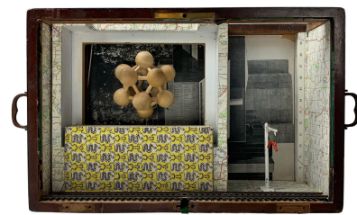
The True Mystery of the World Is the Visible 2021 wood, printed paper & card, metal fixings & model train set 23.5 x 41.8 x 12cm

for higher resolution images go to www.martinpoyner.com/peterdown