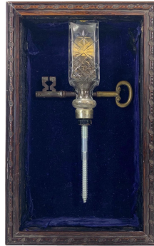
The Practice of Everyday Life 2021 wood, glass, velvet, soil, paint, metal fixings & key 30.2 x 18.5 x 7.9cm