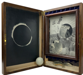
Are We Nearly There Yet? 2021 wood, printed paper, glass, pool ball & metal fixings 35.1 x 49.3(max) x 6.2cm