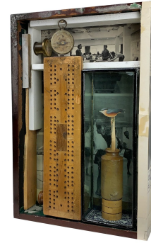
The Spiels of Angeldrom 2021 wood, glass, metal, printed paper, ceramic, soil, metal fixings, compass, perfume lid, cribbage board, draughts & paint 33.2cm x 22.1 x 6.2cm