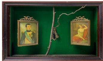
The Epic of Disbelief Blares Oftener 2021 wood, baize, model train line, branch, prints, key hole, card, metal fixings, paint & ink 23.7 x 38cm x 8.1cm