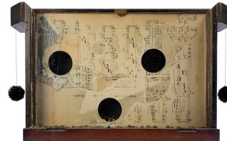
Rothbury Recreation Ground 2022 wood, card, printed paper, perspex, soil, plastic figure, metal fixings, wool, cotton, ink, oil & acrylic paint 28.3 x 46.7 x 8.4cm