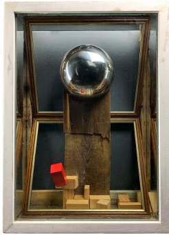
Europa 2.0 2022 wood, mirrors, reclaimed bin lid, glass, paint, metal fixings 59 x 50 x 13.5cm